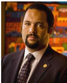
Freedom Fund Banquet Mr. Benjamin T. Jealous, President & CEO NAACP National Office Baltimore, Maryland